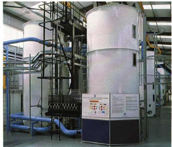
Pilot Carbon Adsorber

The PCI transfer system provides efficient carbon handling with low use of motive water and minimal attrition of carbon.